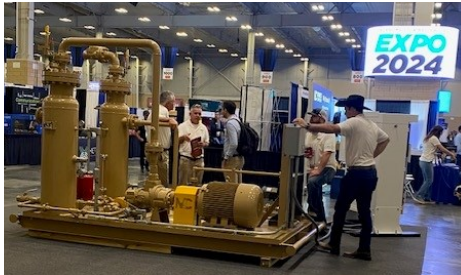
Oklahoma Oil & Gas Expo